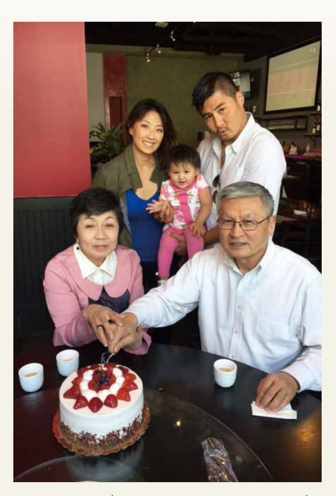
Family photos (The 43rd wedding anniversary)