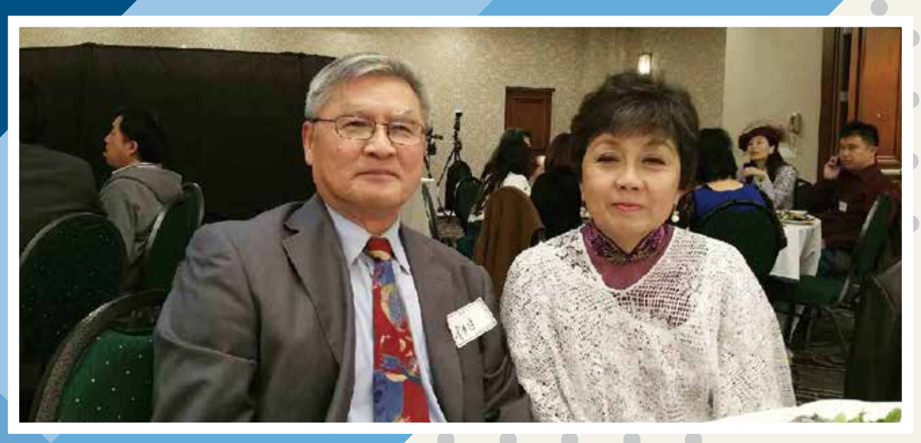
Attending 2015 So Cal NCHU AA annual function